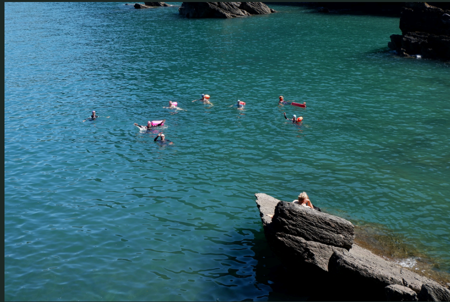
Lyn Seals - Wild Swimming

There are a host of activities to enjoy while staying with us. We are here to curate the perfect retreat schedule for you and your guests.