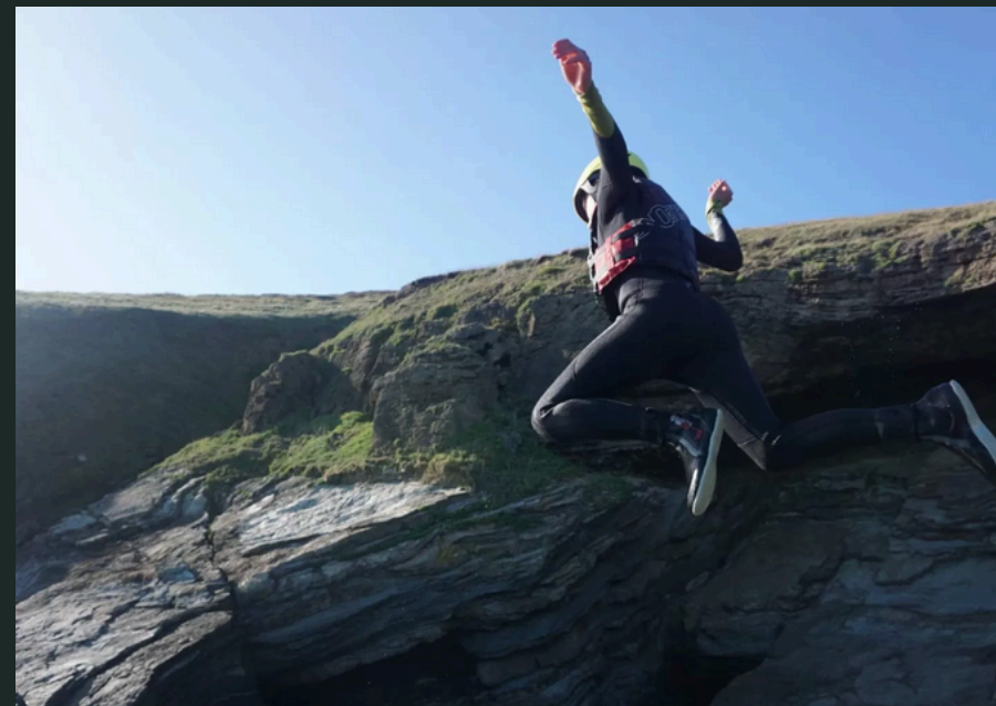
Coastal Adventures - Coasteering