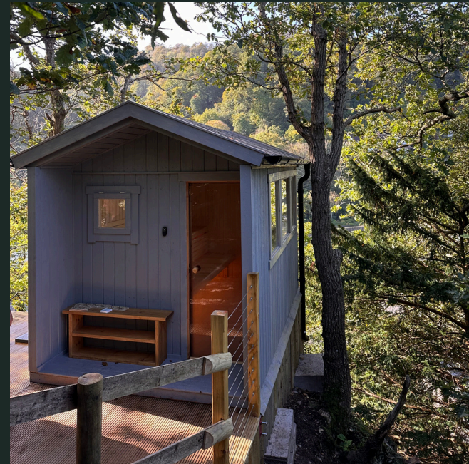
Sauna & Ice Bath

Our brand new tented deck stands amongst the treetops, with a breathtaking view over the sea, perfect for classes and events. SPACE has removable sides for all weather and can accommodate: Up to 60 people seated in rows 25 standing/seated circle 25 yoga mats