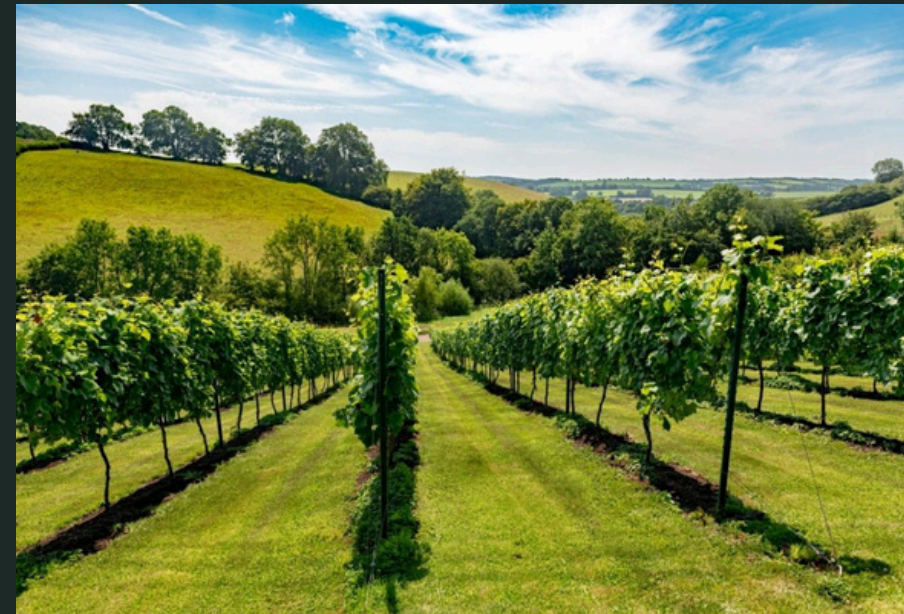
Exmoor Vineyard - Wine Tasting and Tours