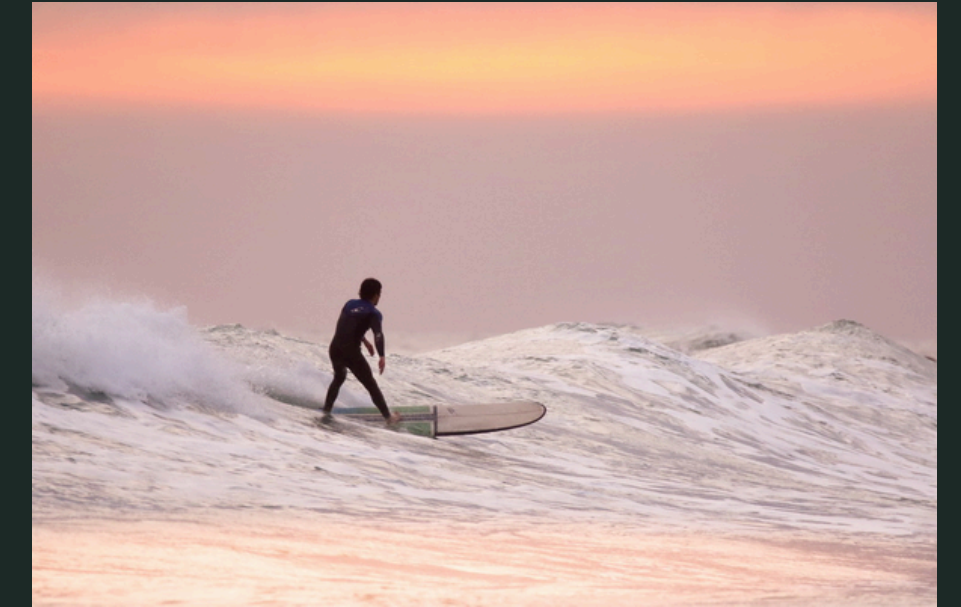
Walking on Waves - Surf School