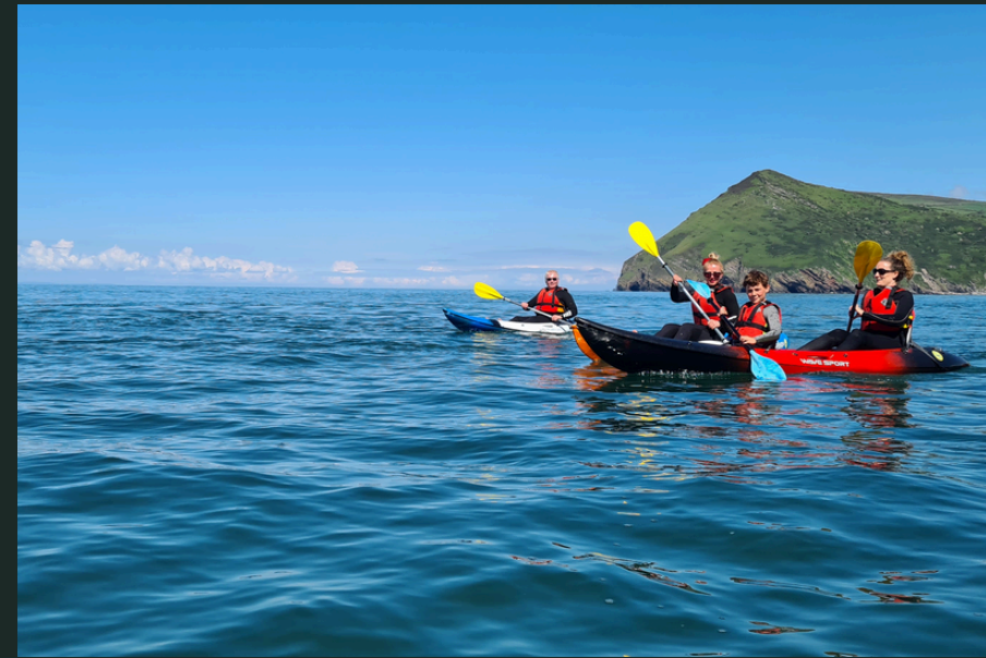
OSKC - Sea Kayaking